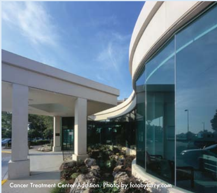
Cancer Treatment Center Addition.