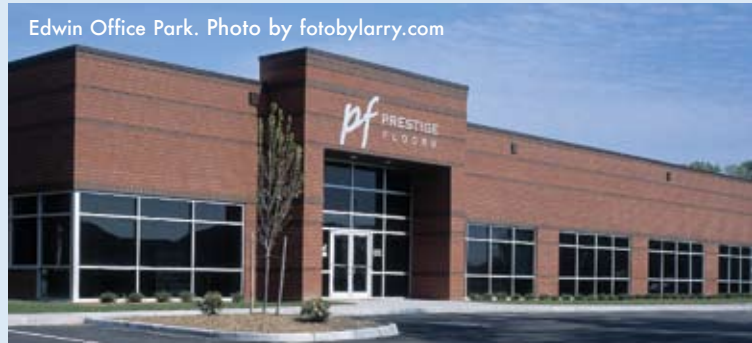
Edwin Office Park.