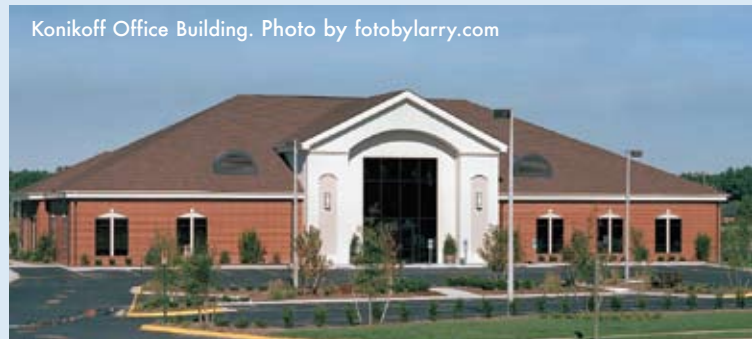
Konikoff Office Building.