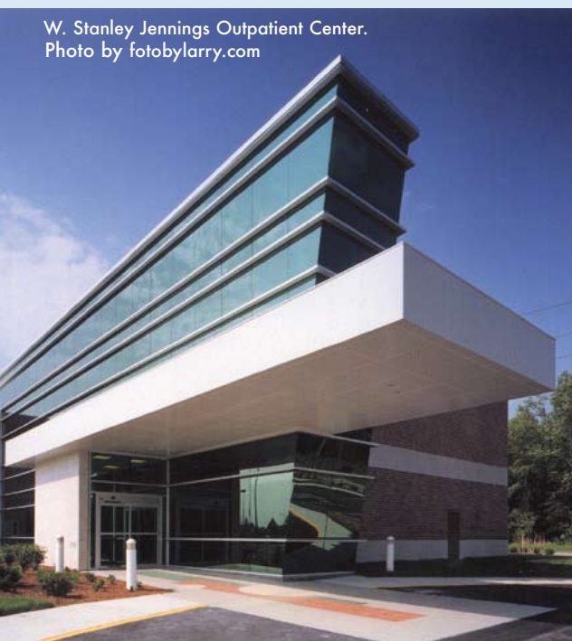
W. Stanley Jennings Outpatient Center.