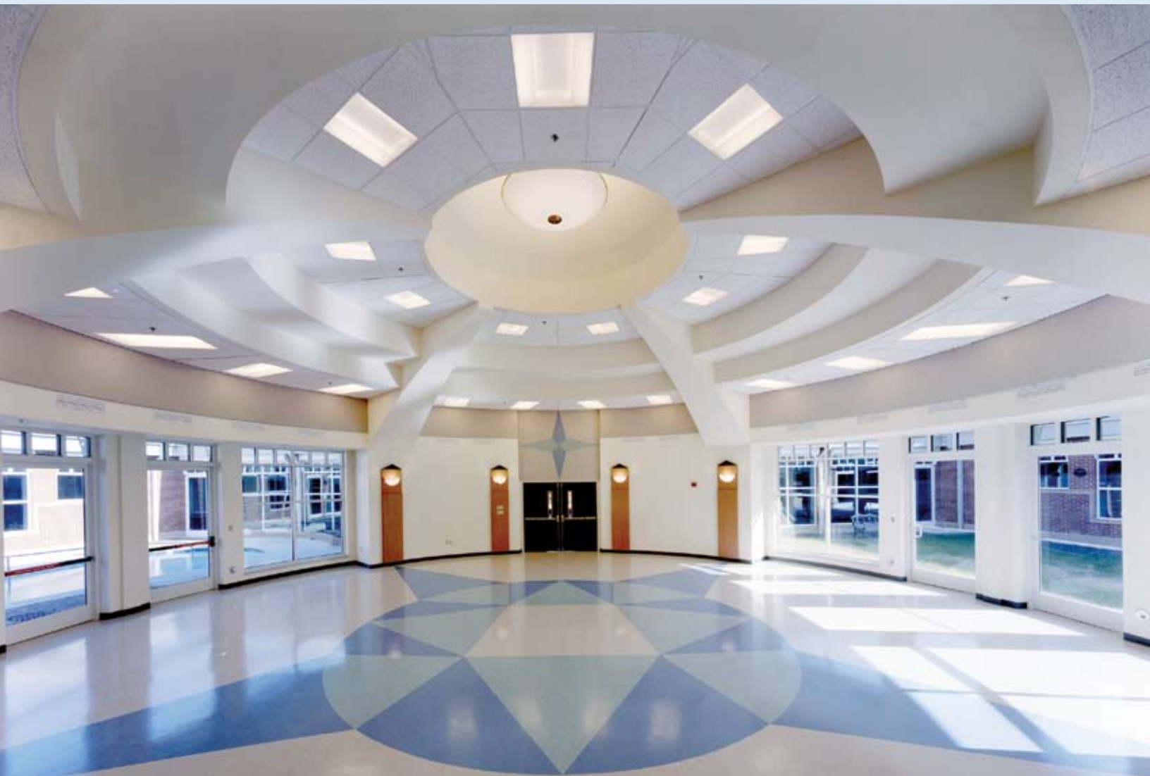
St. Mary's Home for Disabled Children.