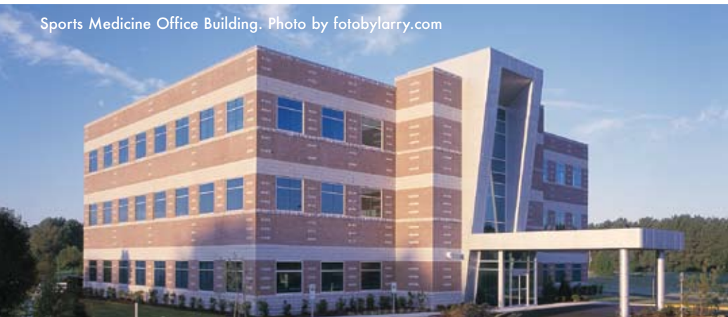
Sports Medicine Office Building.