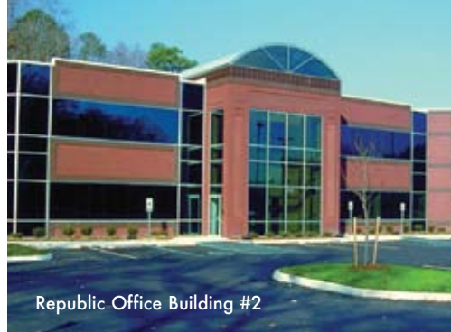
Republic Office Building #2