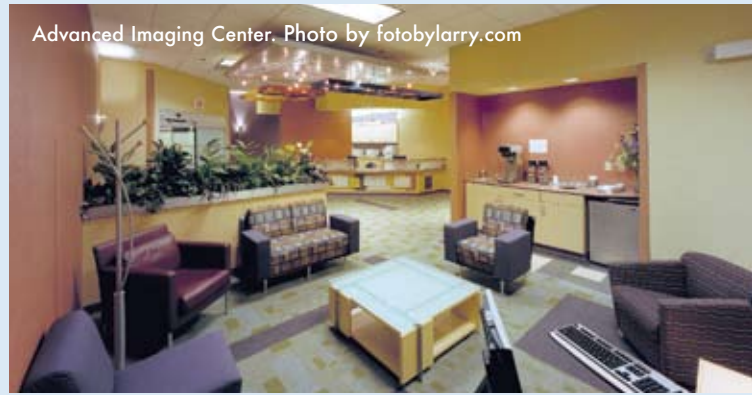
Advanced Imaging Center.