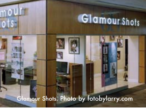
Glamour Shots.