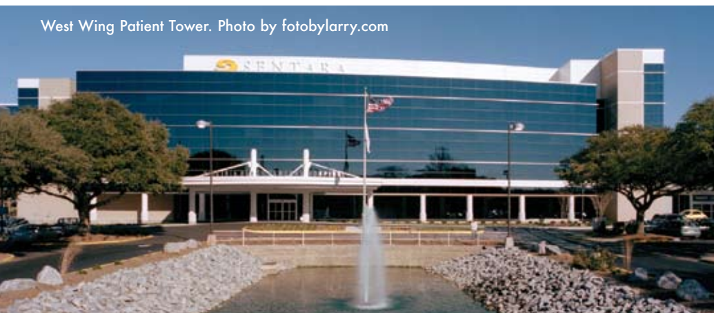
West Wing Patient Tower.